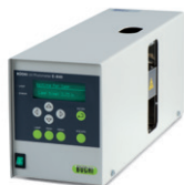
Detector C-640 UV-Vis detection

Modular system expands according to budget and applications up to a fully automated configuration including detection and fraction collection.