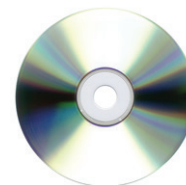
SepacoreControl Software Full control software