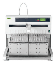
Fraction Collector C-660 Flexible fraction collection