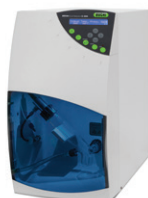
ELS Detector C-650 Evaporative light scattering detector