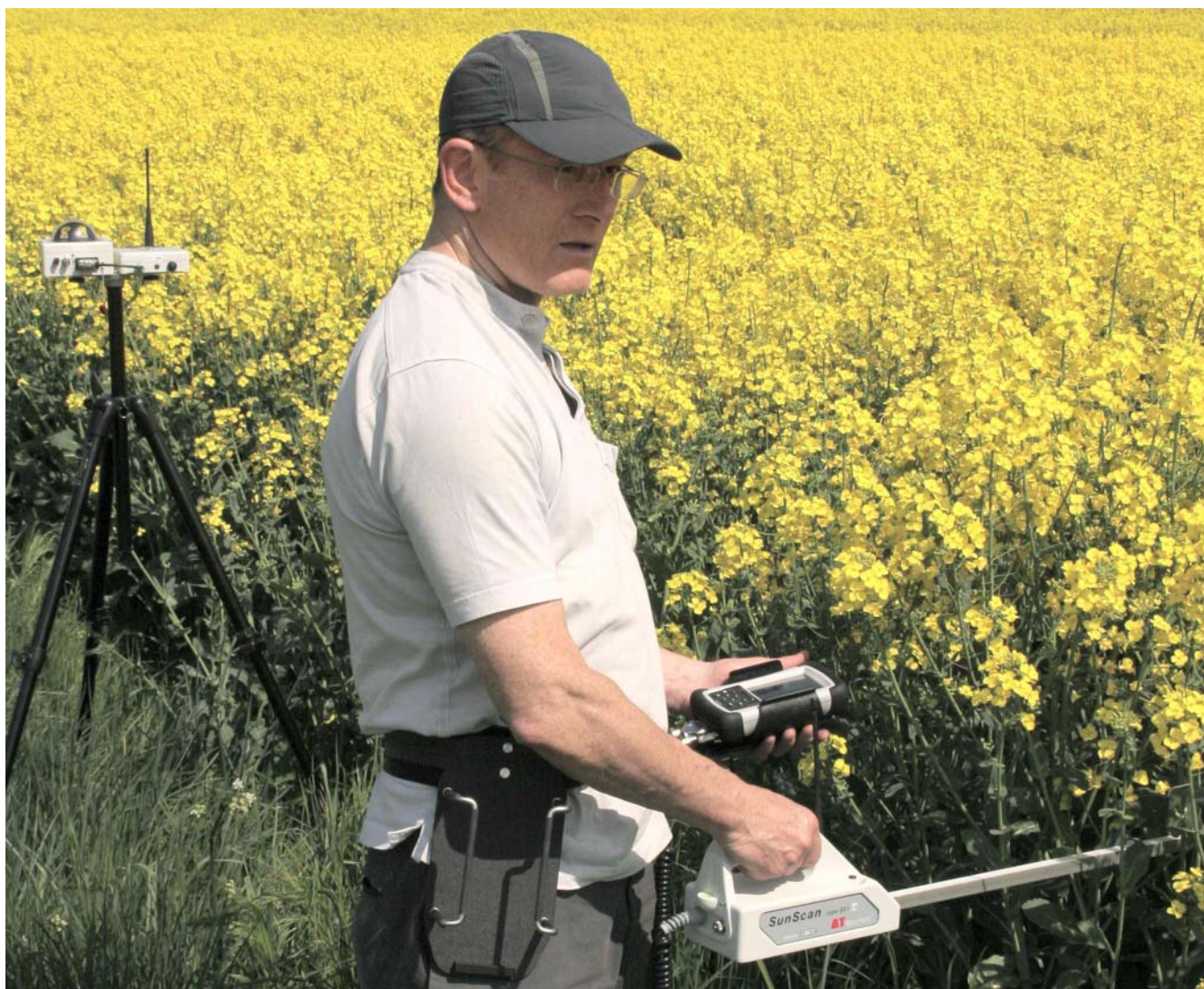
SunScan Probe (radio version) and PDA, with radio-linked BF5 Sunshine Sensor mounted on tripod