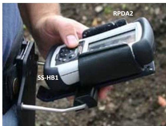
Rugged PDA with the Holster belt type SS-HB1

The RPDA2 is an exceptionally robust handheld PDA which collects and analyses readings from the SunScan Probe. Raw readings, and derived functions such as LAI, can be displayed, reviewed and stored in the field by the SunData Software; groups of readings can be averaged if required. Readings are stored in the internal memory which holds >1 million readings, or in widely available CompactFlash cards which provide removable data storage. Collected data can be transferred easily to a PC.