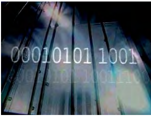
111 9975 License