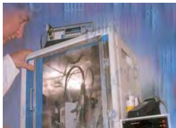
Prices see on the pricelist