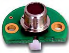
111 9983 CM-2 measuring cell