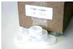
111 0601 ePW sample dishes