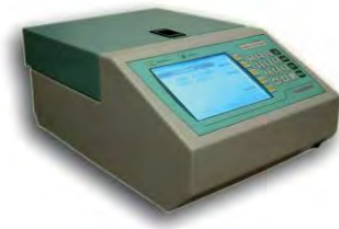
111 9973 LabMASTER-aw “ADVANCED”