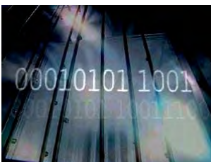
112 0171 License