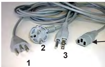
110 8568 Power cable CH : 1 110 8304 EU/Schuko : 2 111 1748 Japan and USA : 3