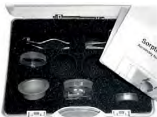
111 9979 SI Set Master