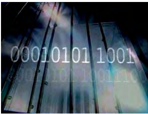
111 9976 License