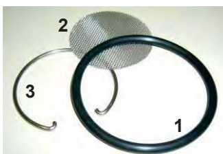
112 0174 O-Ring : 1 112 0175 Metal mesh filter: 2 260 0210 Tension ring : 3