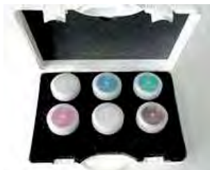
252 5418 Case with 6 Stk SAL-T for LabMaster and LabPartner-aw