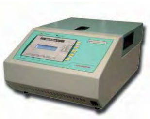
111 9974 LabPARTNER-aw